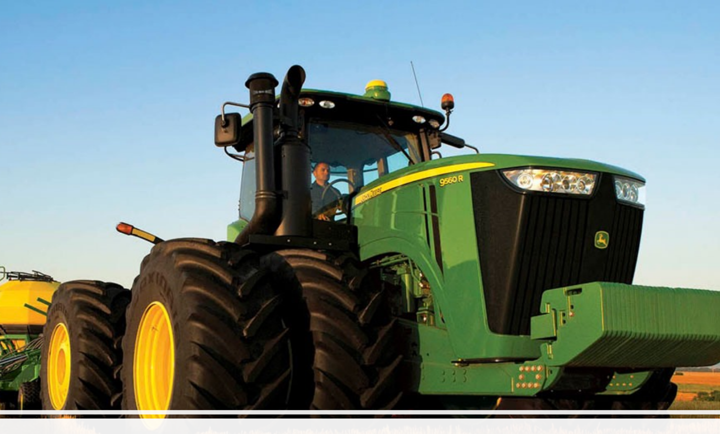
Large Part Molded-in Color